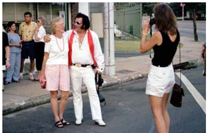
Elvis tribute artist posing with an Elvis fan outside of Sun Studios. Memphis, TN. Elvis Week, 2000.