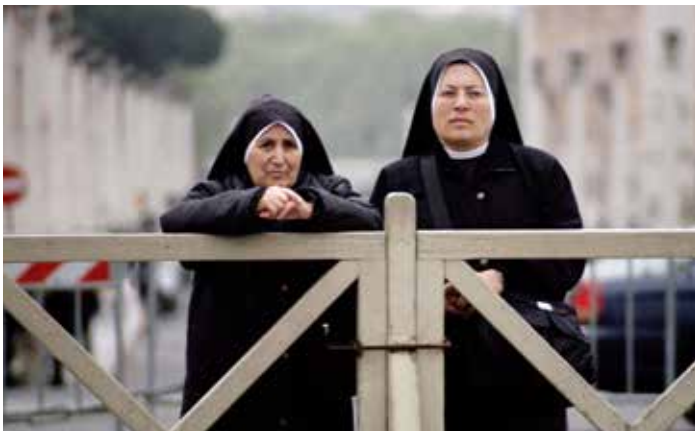
The Faithful Film Still. Two nuns gazing at the Vatican. Rome, Italy. Easter 2000