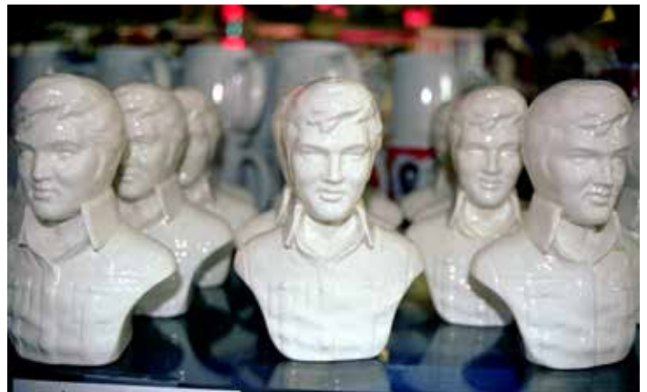
Ceramic busts of Elvis on display at a souvenir shop on Elvis Presley Boulevard. Memphis, TN. 2000.